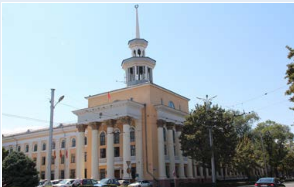
The National Bank of the Kyrgyz Republic Administration building