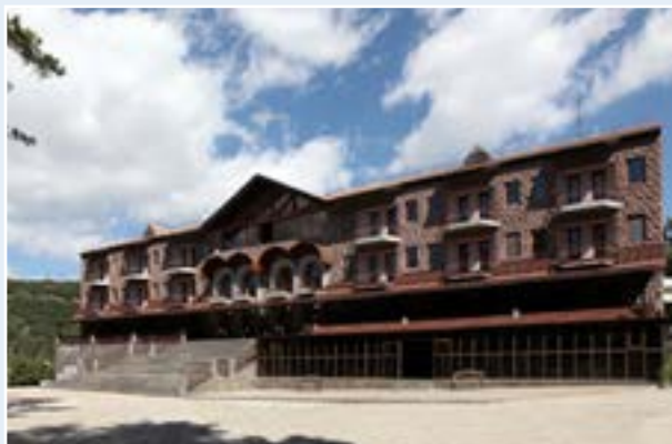
Training Centre of the Central Bank of the Republic of Armenia (Tsakhkadzor)