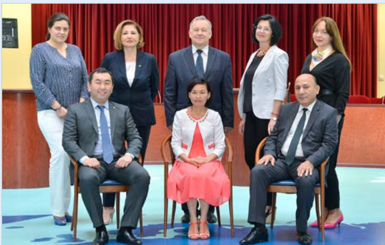
Participants of the 24 th meeting of the Coordination Board on Professional Training for Personnel of the Central (National) Banks 23-24 August 2016, Tula