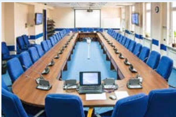
Small conference hall