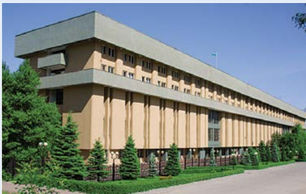
The National Bank of the Republic of Kazakhstan Administration building