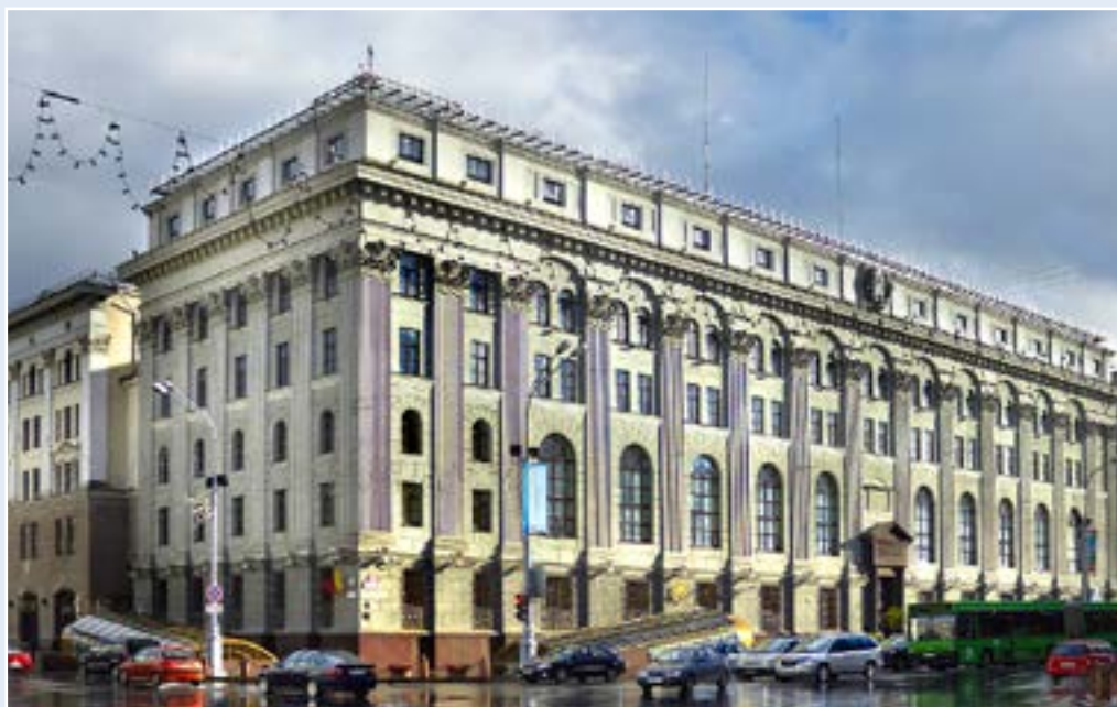
The National Bank of the Republic of Belarus Administration building