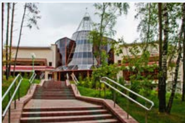
Training Centre of the National Bank of the Republic of Belarus (Raubichi)