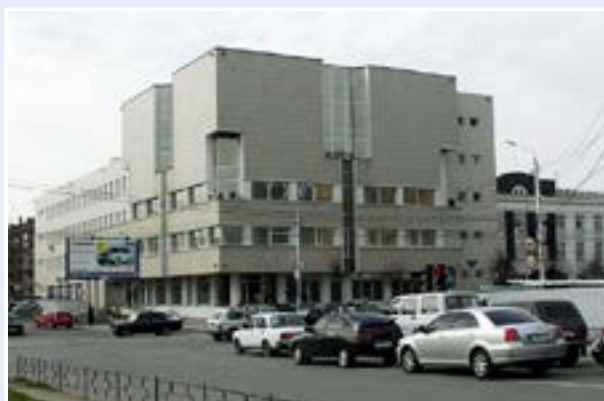
The Interregional Training Centre of the Bank of Russia (Tula)