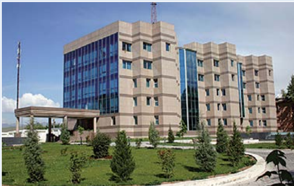
The National Bank of Tajikistan Administration building