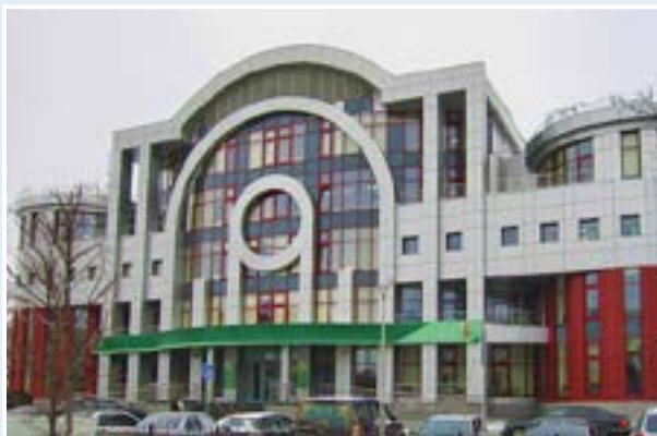
Bank of Russia Corporate University