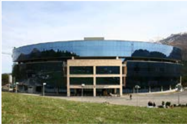
Training and Research Centre of the Central Bank of the Republic of Armenia (Dilijan)