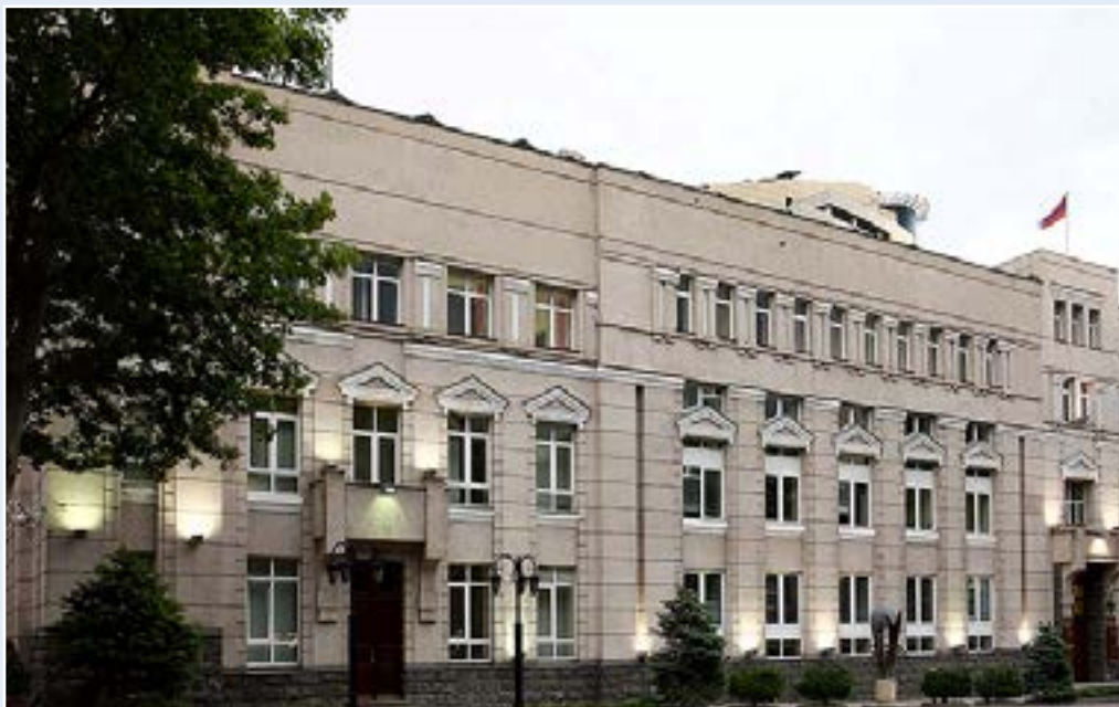
The Central Bank of the Republic of Armenia Administration building