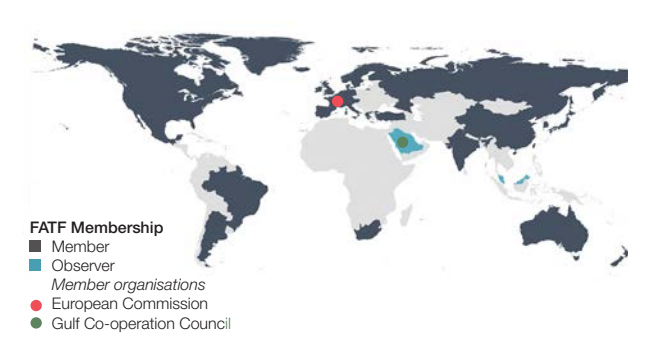
Chart 2. FATF Membership

AML/CFT system and an overall satisfactory level of compliance with the FATF Recommendations. At the June 2015 Plenary, the FATF discussed the mutual evaluation of Malaysia, conducted by the Asia/Pacific Group on Money Laundering (APG). The country must now address the deficiencies identified in this report and report to the FATF Plenary on the progress it has made (see also page 13).