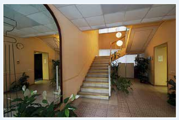
The hall of the Training and Accommodation Building

The Personnel Training Centre of the Bank of Russia is the principal training institution in the Bank of Russia system for professional development. The Centre provides training for executives and employees of the central office and regional branches of the Bank of Russia, including training events with participation of foreign central banks and international organisations representatives.