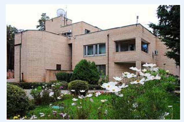
The Personnel Training Centre of the Bank of Russia