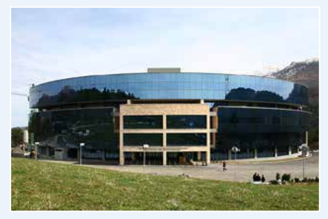
Training and Research Centre Central Bank of the Republic of Armenia (Dilijan)

Training and Research Centre of the Central Bank of the Republic of Armenia is located in the town of Dilijan which is a mountain and balneotherapeutic health resort, 1250-1500 metres above the sea level and 110 km from Yerevan.