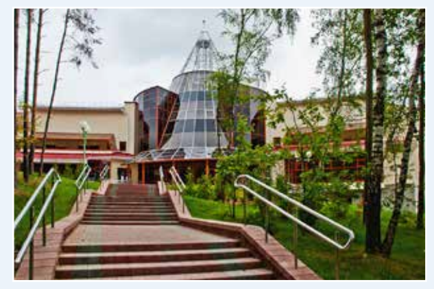
Training centre of the National Bank of the Republic of Belarus (village of Raubichi)

The Training Centre was established on 1 April 1997 as a structural unit of the National Bank of the Republic of Belarus for the purpose of organising and carrying out training events for executives and experts of the Republic of Belarus banking system in key banking areas and in the field of information technologies.