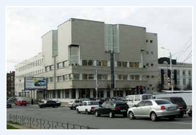
The Interregional Training Centre The Bank of Russia (Tula)

The Interregional Training Centre was established in 1996 to enhance qualifications of the Bank of Russia personnel in important banking areas.