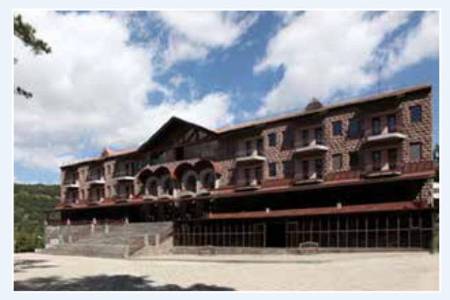
Training Centre of the Central Bank of the Republic of Armenia (Tsakhkadzor)

The Training Centre is a structural unit of the Central Bank of the Republic of Armenia.