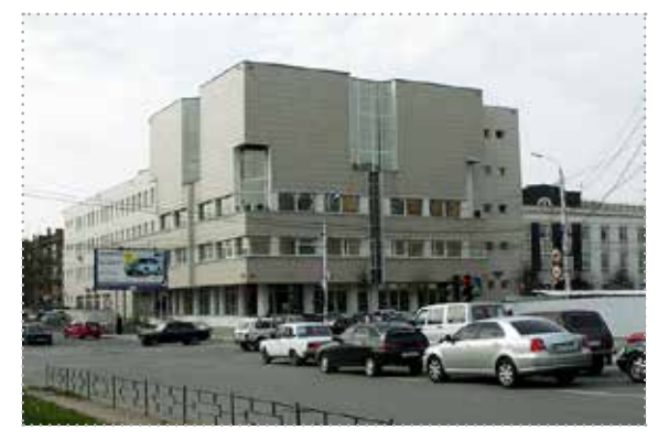
Interregional Training Centre of the Bank of Russia (Tula)