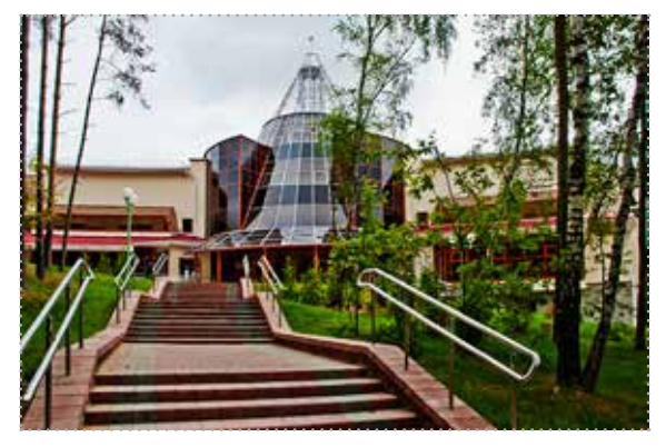
Training centre of the National Bank of the Republic of Belarus (Raubichi)