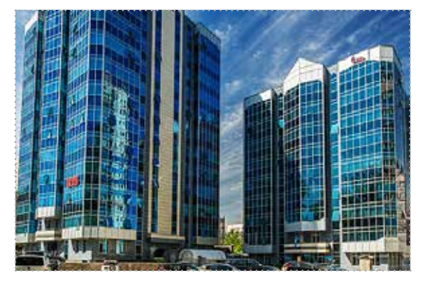
Training Centre of National Bank of the Republic of Kazakhstan (Almaty)

"Training Centre of National Bank of the Republic of Kazakhstan" JSC is a subsidiary of the National Bank of the Republic of Kazakhstan and was established after the reorganisation of the "Academy of Almaty regional financial centre" JSC, 27 April 2017.