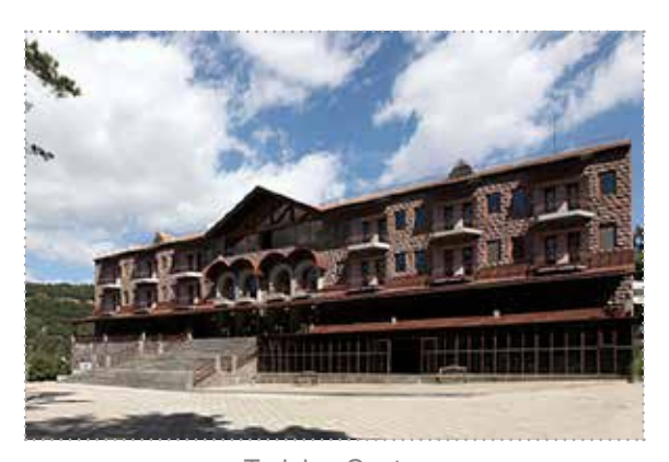
Training Centre of the Central Bank of Armenia (Tsakhkadzor)

The Training Centre is a structural unit of the Central Bank of Armenia.