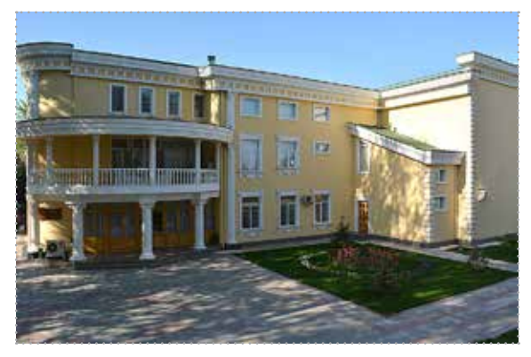
Training Centre of the National Bank of Tajikistan (Guliston)

Training Centre of the National Bank of Tajikistan was established in order to organise professional development courses for banking system specialists. The construction of the Training Centre considered all the specifics of this activity to create necessary conditions to welcome and accommodate guests, as well as to organise different events at the appropriate level.