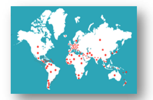
Figure 2. The FATF Recommendations have been endorsed by more than 180 jurisdictions across the world.

In addition, there are a very large number of other international organisations that have observer status FATE. with the These institutions generally also have, along with their other functions. anti-money an laundering counteror terrorist financing responsibility. FATF observers include global financial institutions, such as the IMF and the World Bank;